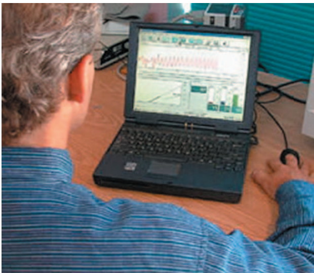
Figure 2. The Freeze-Framer® heart rhythm coherence feedback trainer.

Heart rhythm coherence feedback training is a powerful tool to help people learn to self-generate states of increased physiological coherence at will, thereby reducing stress and improving health, emotional well-being, and performance. A new HRV feedback system known as the Freeze-Framer (Quantum Intech, Inc., Boulder Creek, CA) incorporates a patented technology that enables physiological coherence to be objectively monitored and quantified. Using a fingertip or earlobe plethysmographic sensor to detect the pulse wave, this interactive hardware/software system plots changes in heart rate on a beat-to-beat basis. Both the heart rate tachogram and the HRV power spectrum can be viewed in real time. The software also includes a tutorial that provides instruction in the HeartMath positive emotion-focused coherence-building techniques. As users practice the techniques, they can readily see and experience the changes in their heart rhythm patterns, which generally become less irregular, smoother, and more sine wave-like as they enter the coherent mode. This process enables individuals to easily develop an association between a shift to a more healthful and beneficial physiological mode and the positive internal feeling experience that induces such a shift. The software also analyzes the heart rhythm patterns and calculates a coherence ratio for each session. The coherence level is fed back to the user as an accumulated