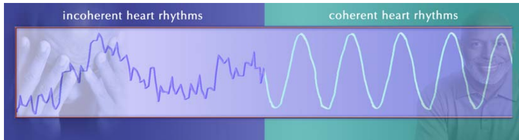
Freeze-Framer 2.0 displays heart coherence

Research at the Institute of HeartMath has shown that emotions are reflected in the beat-to-beat changes in the heart's rhythms. This is called heart rate variability, or HRV. The analysis of HRV is recognized as a powerful, non-invasive way to measure nervous system dynamics. New clinical research identifies HRV as a key indicator of preventable stress and shows a relationship to a wide range of health problems.