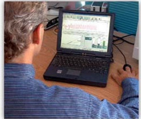
On-Demand, Real-Time Stress Management

With HeartMath techniques and the Freeze-Framer Learning System you address the causes of stress, negative emotions and nervous system chaos. It helps you re-train your mind and body to respond differently to potentially stressful situations. The System is already being used successfully by executives and managers in Fortune 100 companies, the military, health care professionals and educators and it's based on solid scientific research.